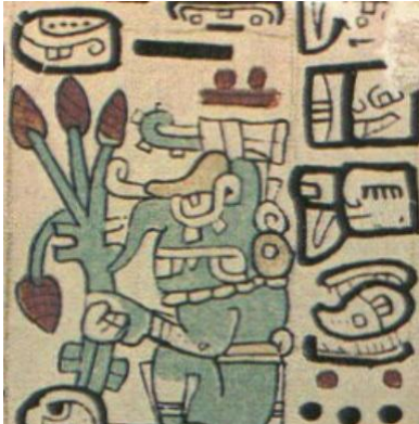
Pictorial Writing – Mesoamerica circa 1200 CE

The general use of the term codex refers to a written picture document most commonly from prehistoric Mexico. The largest number of examples of the codex is from the Aztec and also from the Mixtec, Maya, and others.